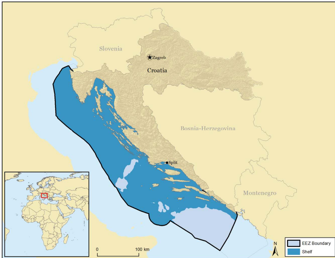
Figure 1. The Exclusive Economic Zone (EEZ) and shelf areas less than 200 m depth for Croatia in the Adriatic Sea.

shelves covering 73.9%. The depth gradually increases from the northwest (max. 50 m) to the southeast (max. 1,330 m). Depths greater than 200 m are only found in the central and southern parts. The Adriatic Sea is a relatively warm sea (summer sea surface temperatures are usually between 22-25° C) and its basin is distinguished by a relatively high salinity of about 38.3 psu (Buljan and Zore-Armanda 1971). A strong connection between the Adriatic and the eastern Mediterranean is supported by water masses flowing into the Adriatic from the Eastern Mediterranean along the east coast of the Adriatic and flow out along the west coast.