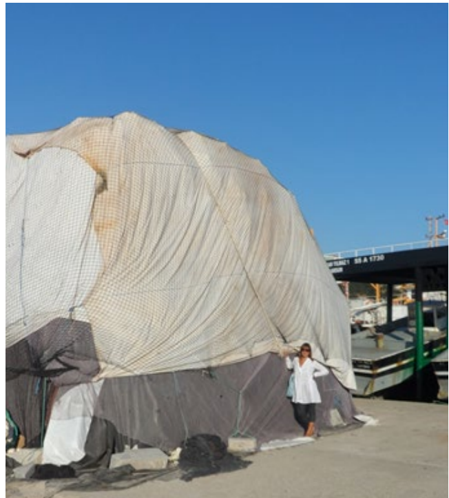
Some industrial-sized driftnets (averaging 6 km in width) in Poyrazköy on the north-eastern tip of the Bosphorus Strait, and me for size comparison.

operative. Everywhere, fishers were very open and helpful to me, which surprised me. Many were asking me: "Why does our government not try to learn how our seas have changed, yet a Canadian is out there with us trying to understand it?" I then realized just how privileged we are to be able to conduct this type of study. I was most surprised by how welcomed I was by the industrial fishers. I had gone there with a preconceived notion that these were the bad guys, wielding an immense fishing power. However, I quickly learned that these were the true 'traditional' fishers of the country, many whose families had been fishing for hundreds of years. They really care about the future of the fisheries and are desperately seeking some sort of output control to manage the stocks.