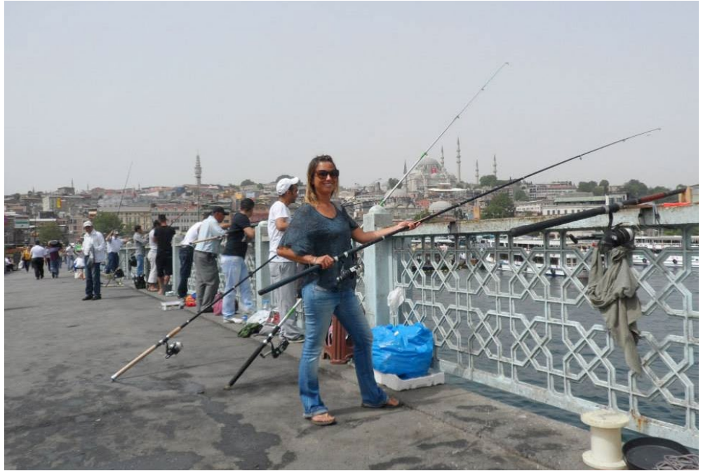
The author conducting research on recreational anglers on Galata Bridge, in the Golden Horn estuary of Istanbul